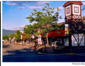
Main Street Summerland