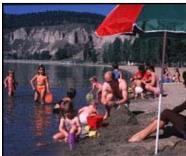
Okanagan Lake Beaches