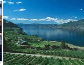
Summerland Lake View