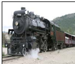
Kettle Valley Railway